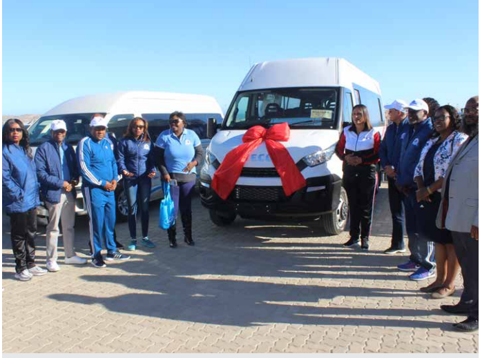
Representatives of various SOEs handover the vehicle to the school.