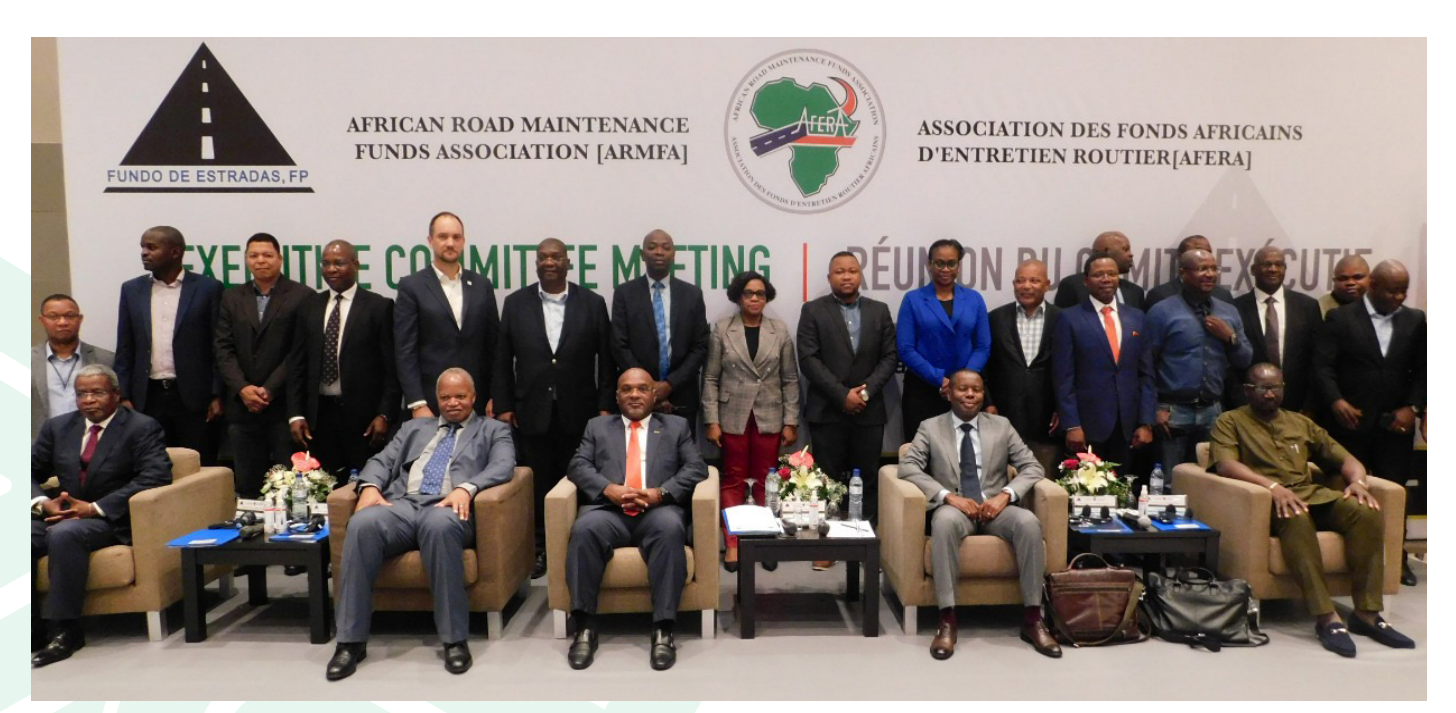
Executive Committee Members of the ARMFA Southern Africa Focal Group at the EXCO Meeting held in Luanda, Angola

Executive committee meetings were held in Mozambique and Angola with the ARMFA Southern Africa Focal Group in September 2022, where delegates shared best practices in road maintenance funding and kept abreast with developments in the funding of the roads sector. Additionally, the meetings proved important for regional representatives to report on annual progress in the regional bodies, which are affiliates of ARMFA.