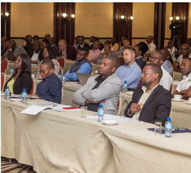
Attentive delegates during the Business Plan Stakeholder Consultation Meeting