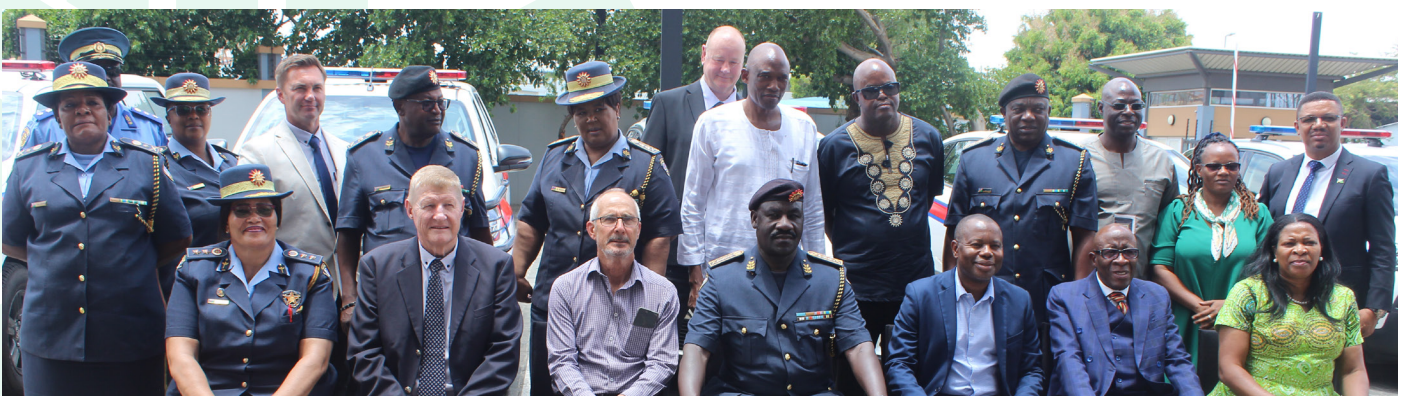
Traffic law enforcement and road safety stakeholders during the handover ceremony