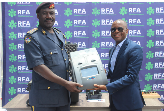
The Inspector General and RFA CEO show the calibration machine that was procured along with the new fleet