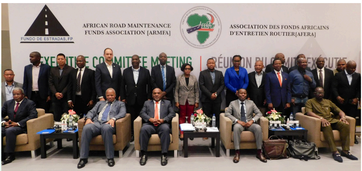
Executive Committee Members of the ARMFA Southern Africa Focal Group at the EXCO Meeting held in Luanda, Angola

Executive committee meetings were held in Mozambique and Angola with the ARMFA Southern Africa Focal Group in September 2022, where delegates shared best practices in road maintenance funding and kept abreast with developments in the funding of the roads sector. Additionally, the meetings proved important for regional representatives to report on annual progress in the regional bodies, which are affiliates of ARMFA.