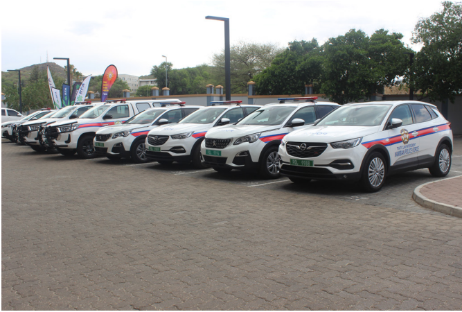
Part of the new fleet