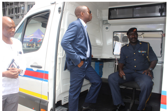
Inside the police van newly converted to a Booze Van to combat driving under the influence of alcohol offences