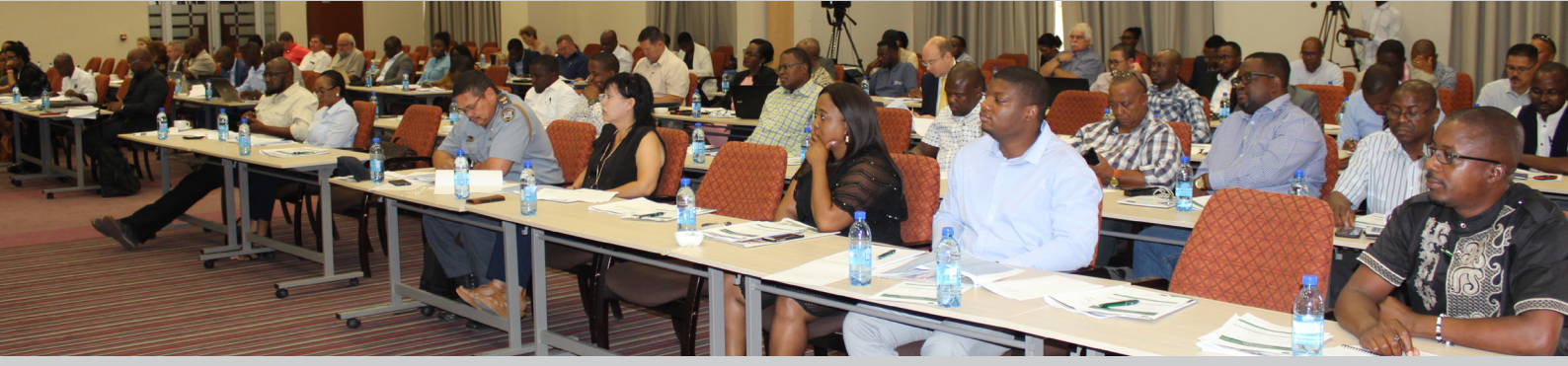
Five-year Business Plan Stakeholders Consultation meeting