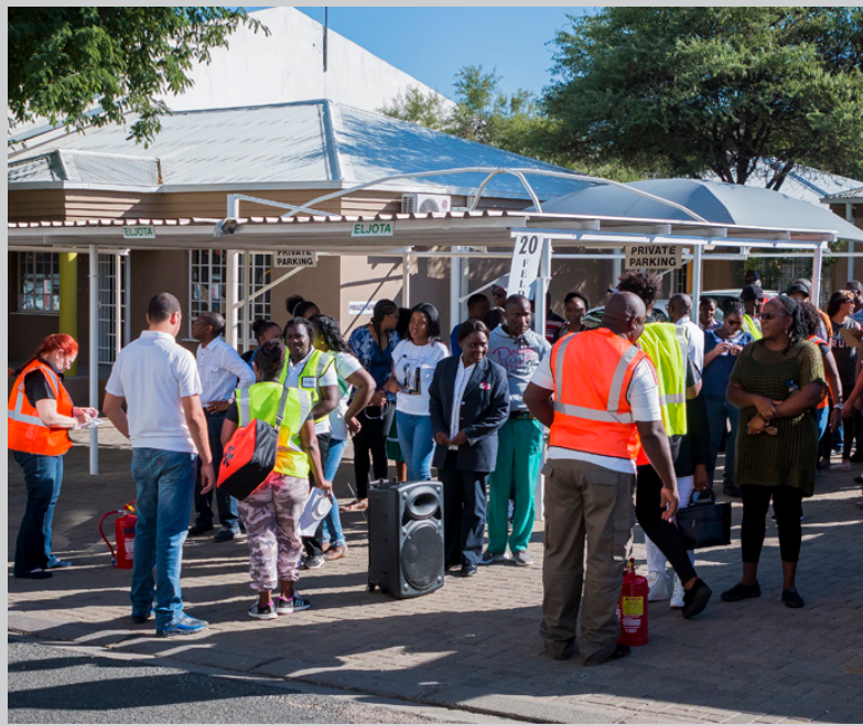
RFA Fire Marshals conducting a head count after the evacuation of the building