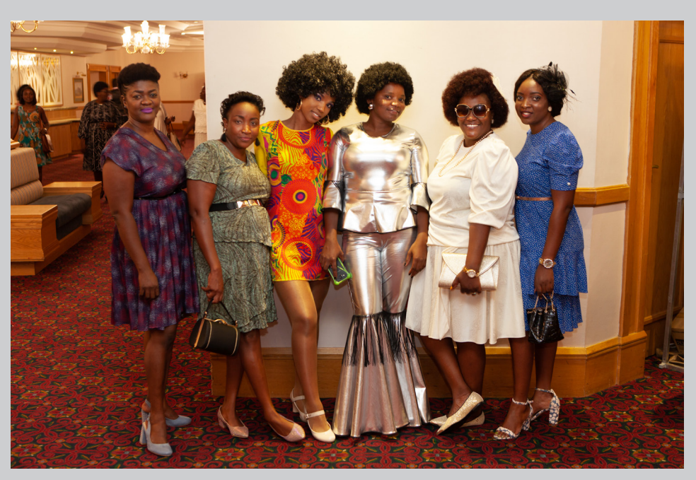
RFA employees showed up in true Disco Afro Punk of the 60's and 70's

At the event, employees who rendered exceptional service or delivered outstanding performance during the year in the execution of their duties were recognised and awarded cash prizes and gift vouchers, an incentive that serves as motivation and encouragement to ensure competitiveness.