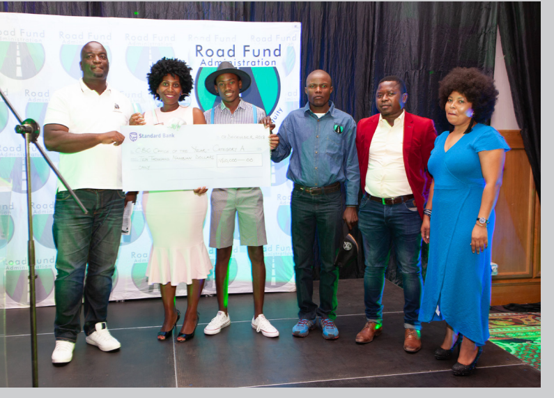
Wenela Border Post received the CBC Office of the Year award in- Category A