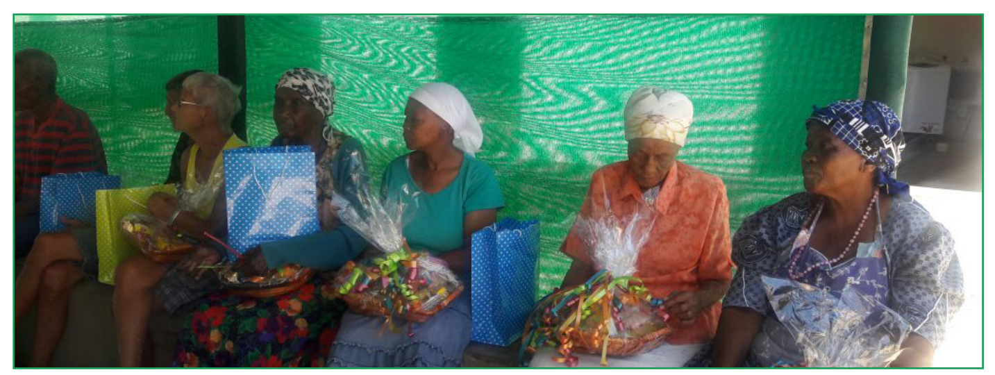
Immanuel Old Age Home - Okahandja